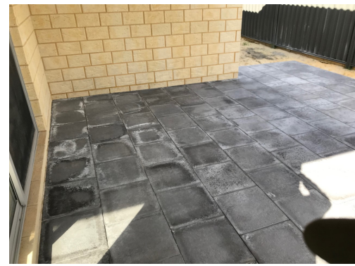
Dangerous Hydrochloric Acids Causes Damage