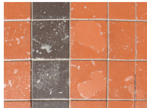
Sealer Popping and Delaminating