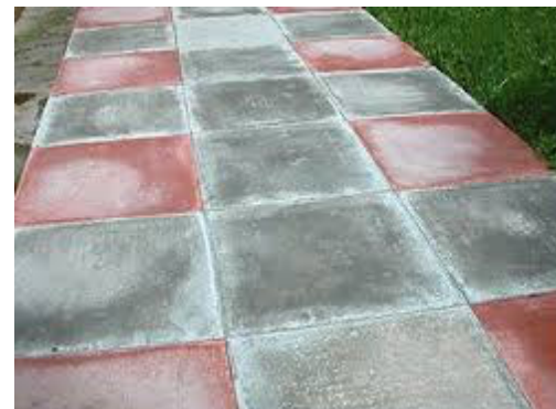
Moisture Lock Gives Pavers an Ugly Appearance