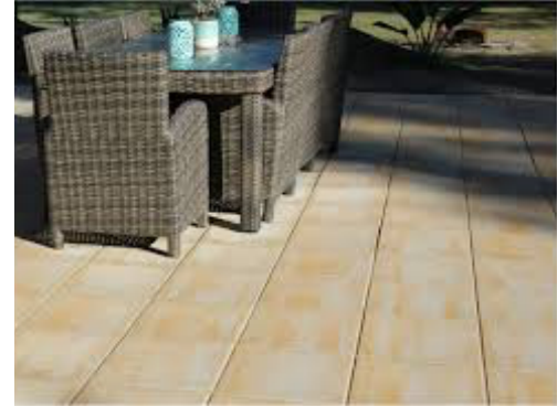
Patchy, Faded & Sealer Turning Yellow